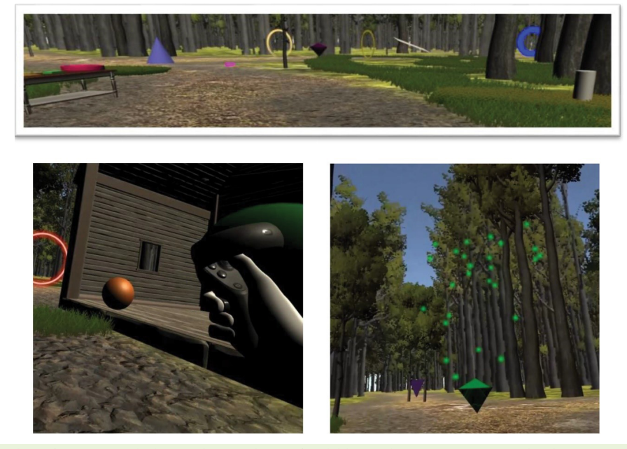
Figure 1. Three Screenshots of Geometry Park, the VR Educational Game for Children With ASD. Note. VR: Virtual reality; ASD: Autism spectrum disorder

As part of the training content for the intervention group, a VR game named "Geometry Park" (Figure 1)